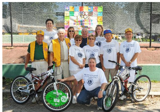
Hudson Lions take time out for a group picture at their 19th annual Junior Olympics event.