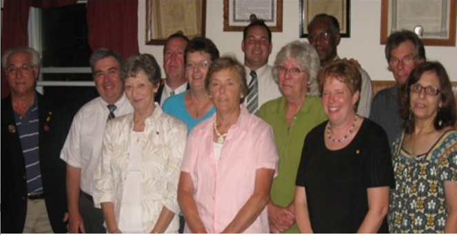
The Millerton Lions honored scholarship winners, inducted 2 new members, and installed officers at a recent dinner.