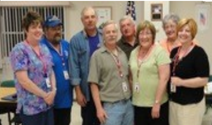
Minisink Valley Lions Club recently assisted the Metro NY Red Cross Ready When the Time Comes (RWTC) program. Red Cross responses to extreme local flooding along the Delaware River inspired the club to become involved in this program.