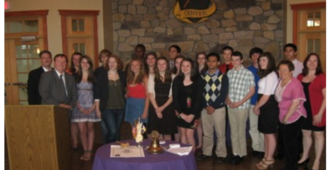
The Goshen LEO Club at their charter meeting in June.